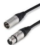
Pack of audio lead