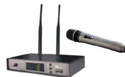
Wireless microphone (only for LDP2.0M)